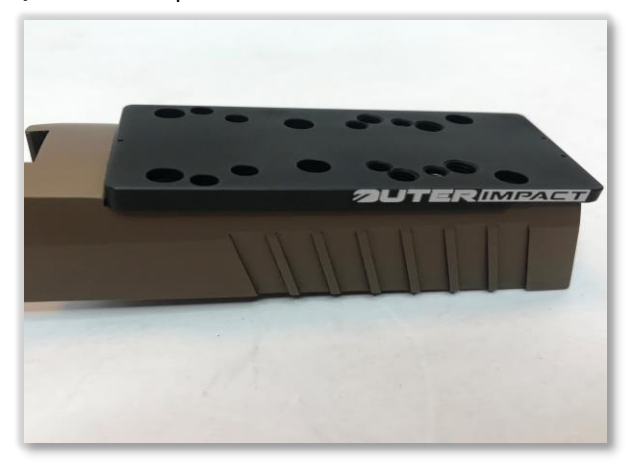
Step 4: Reassemble slide per manufacturer instructions.

Step 3: Secure adapter plate to slide using the 4-48 screws from the bag marked MNT HDWR and torque to 15 in/lb with a torque wrench.